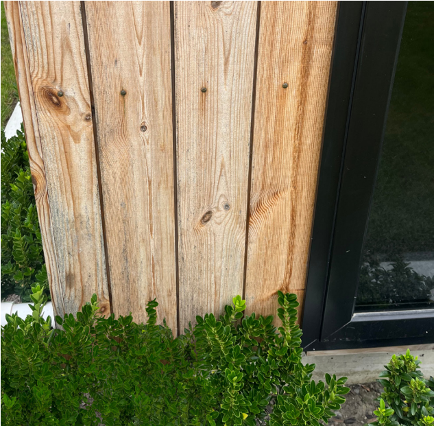
Vegetation too close to the weatherboards, restricting airflow, retaining moisture, and obstructing access for future maintenance.