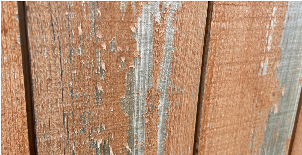
Example of coating issue. It must be addressed promptly to prevent further damage.

Annual inspections are essential to ensure that all aspects of the cladding system remain in a weatherproof condition. Any identified damages or areas showing signs of deterioration which would allow water ingress, must be repaired immediately. Repair procedures for sealants, coatings, flashings, scribes, decorative elements or the weatherboards must be performed in accordance with the relevant manufacturer's instructions.