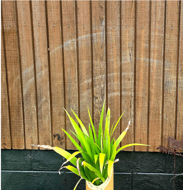
Signs of wear from vegetation contact—this cladding surface was scratched by nearby plants.