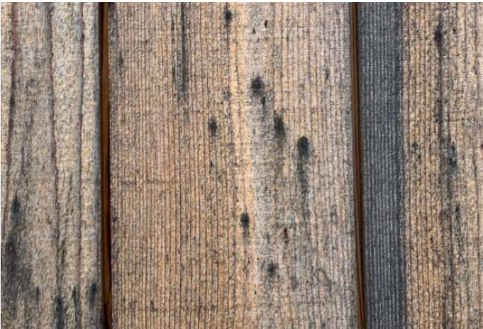
Cladding affected by mould growth and black spots.

Black spots can be minimised by using good quality exterior grade cladding coating. Black spots often disappear over time when regular cleaning is performed.