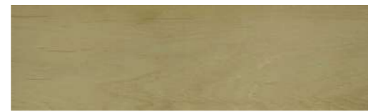
RAW ALASKAN YELLOW CEDAR

JSC Alaskan Yellow Cedar's resistance to water, impact, and decay ensure longevity, making it a top choice for coastal environments.