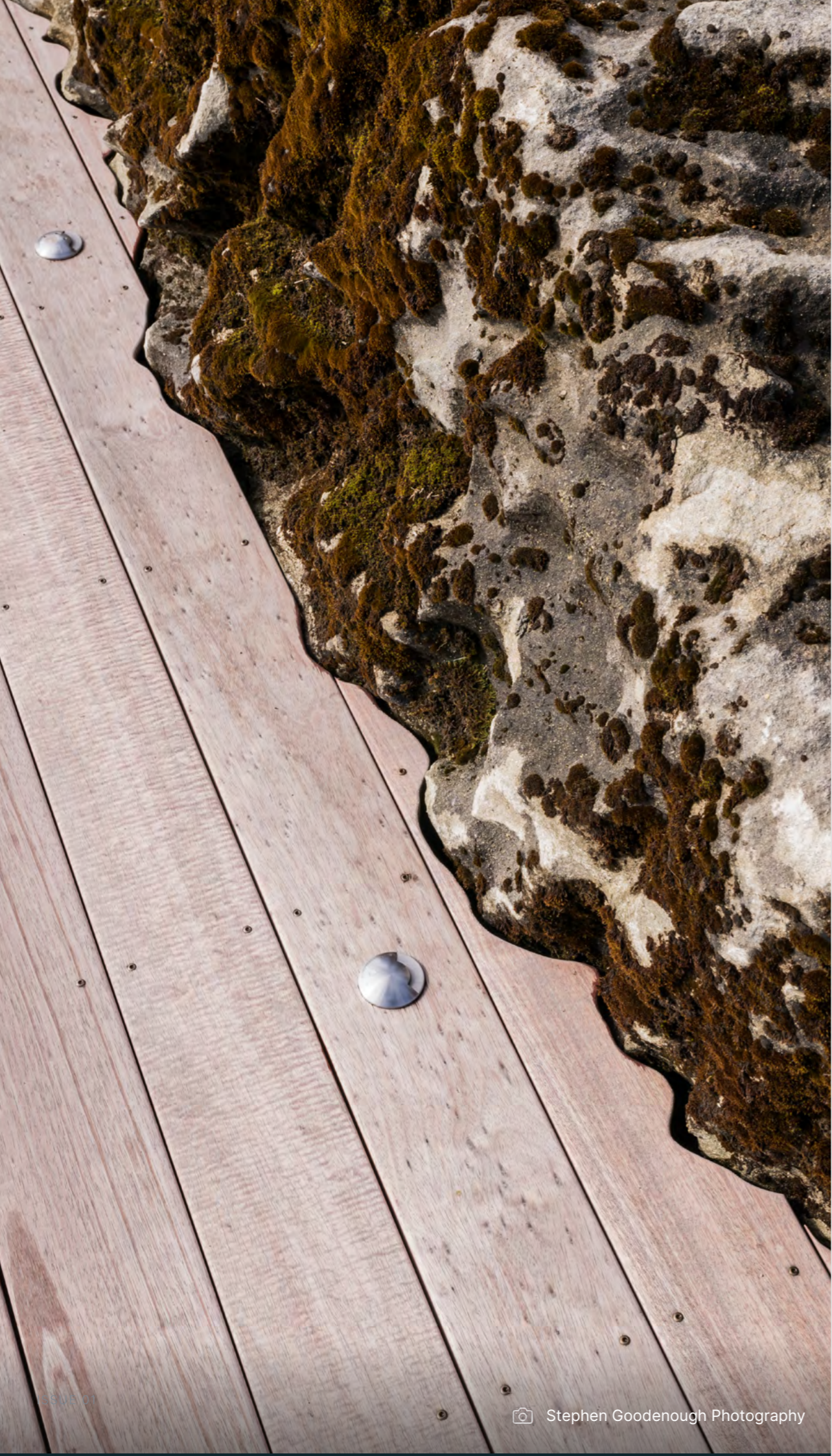
Stephen Goodenough Photography