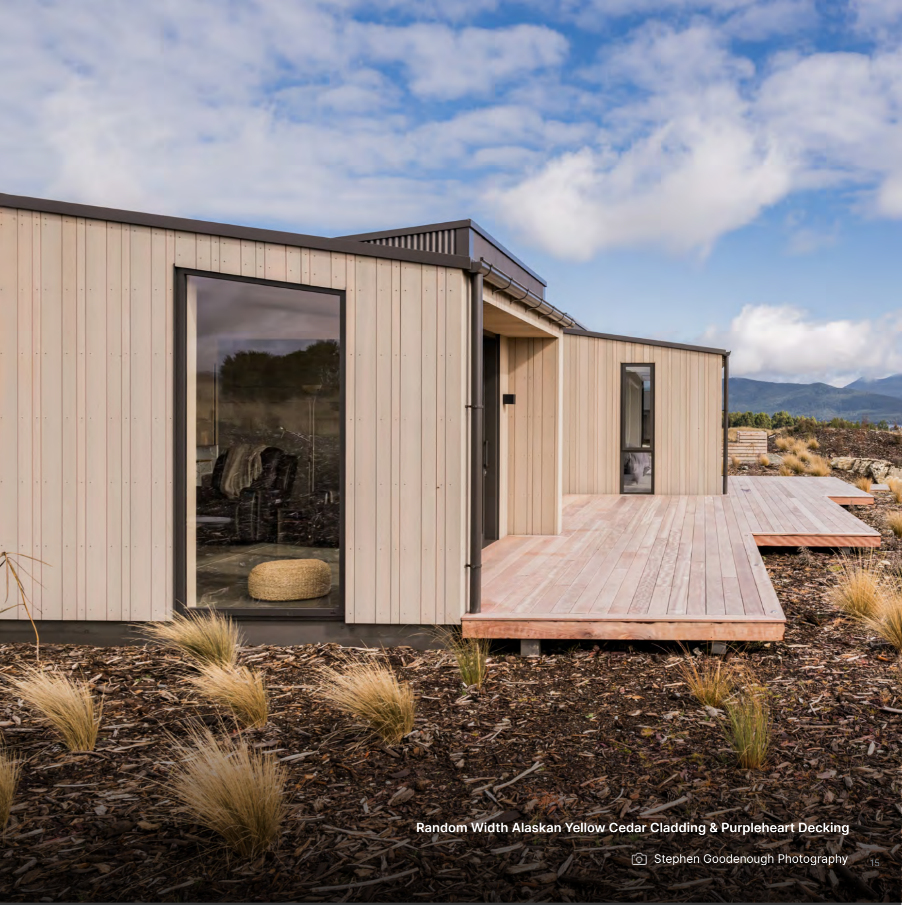
Random Width Alaskan Yellow Cedar Cladding & Purpleheart Decking