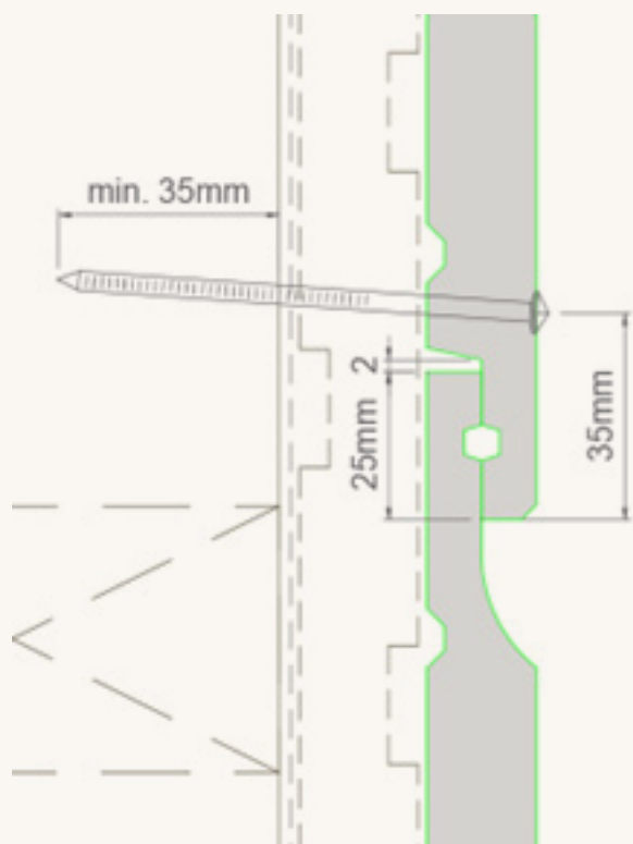
Figure 1 - Typical Vertical Shiplap Weatherboard Installation

NOTE: The bottom boards of any wall should have an additional coat to the exposed back of the board to ensure waterproofing and should then be top-coated wherever visually exposed – E.g. at the outside bottom edge of the soffit