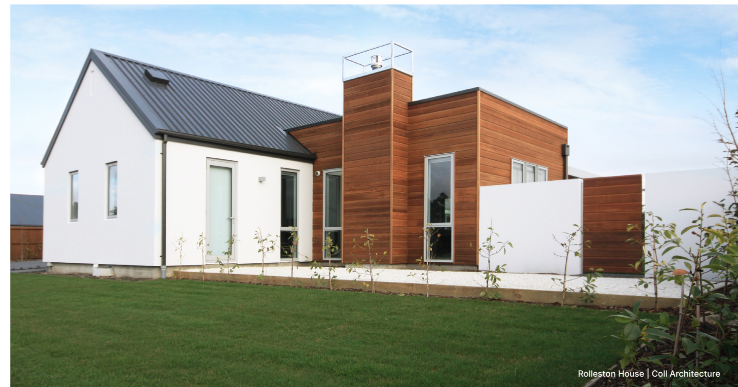
Rolleston House | Coll Architecture

40 mm x 2.0 mm grade 316 stainless steel may be used to retain hidden lap tongues of weatherboard profiles. Clinch nails are not a requirement of JSC or E2/AS1 and are an aide to installation only.