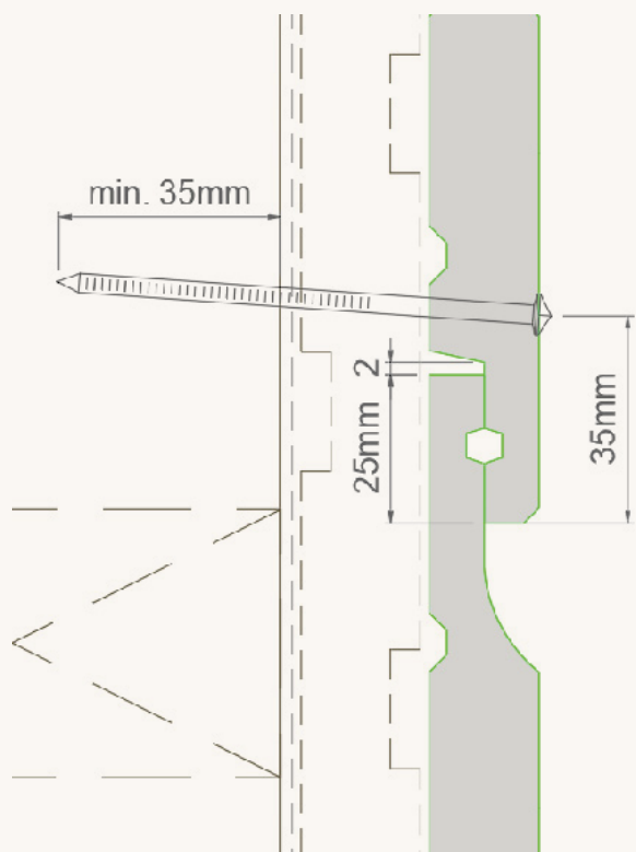
Figure 1 - Typical Vertical Shiplap Weatherboard Installation

NOTE: The bottom boards of any wall should have an additional coat to the exposed back of the board to ensure waterproofing and should then be top-coated wherever visually exposed – E.g. at the outside bottom edge of the soffit