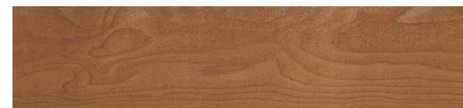
WESTERN RED CEDAR