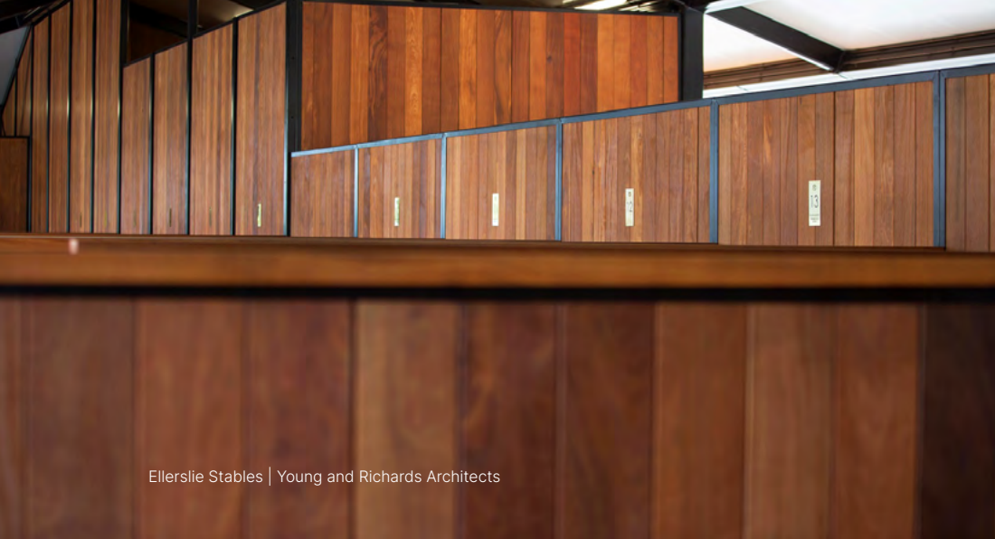
Ellerslie Stables | Young and Richards Architects