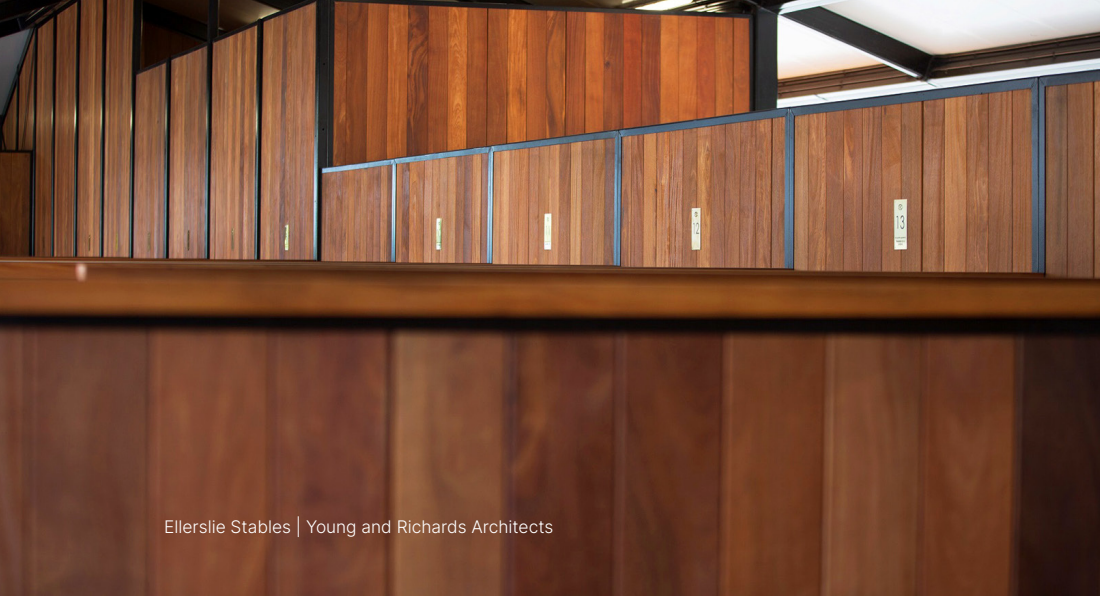
Ellerslie Stables | Young and Richards Architects