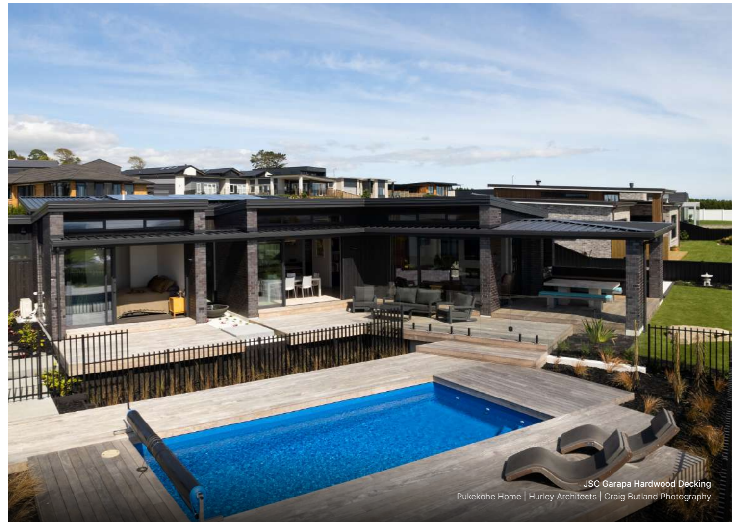
JSC Garapa Hardwood Decking Pukekohe Home | Hurley Architects