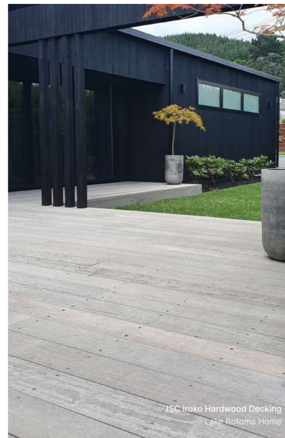
JSC Iroko Hardwood Decking Lake Rotoma Home