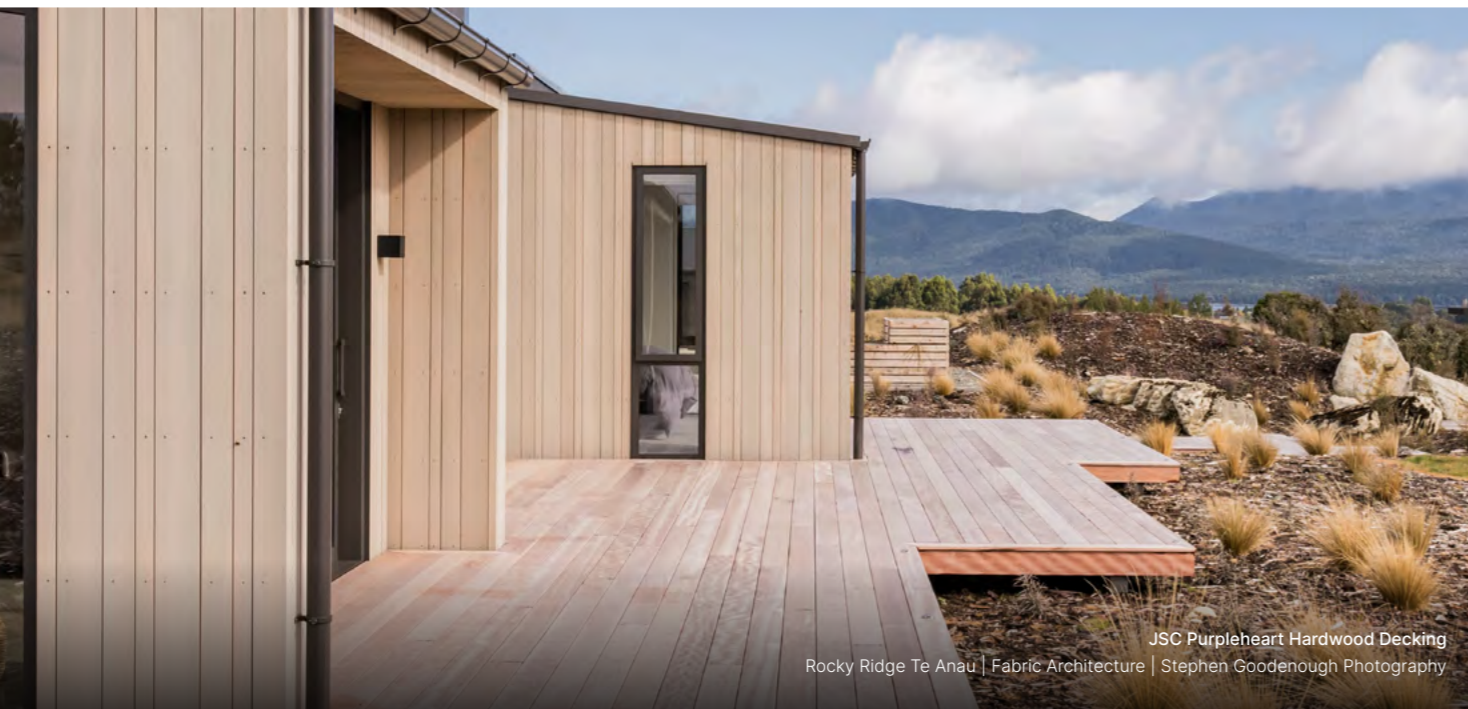
JSC Purpleheart Hardwood Decking Rocky Ridge Te Anau | Fabric Architecture