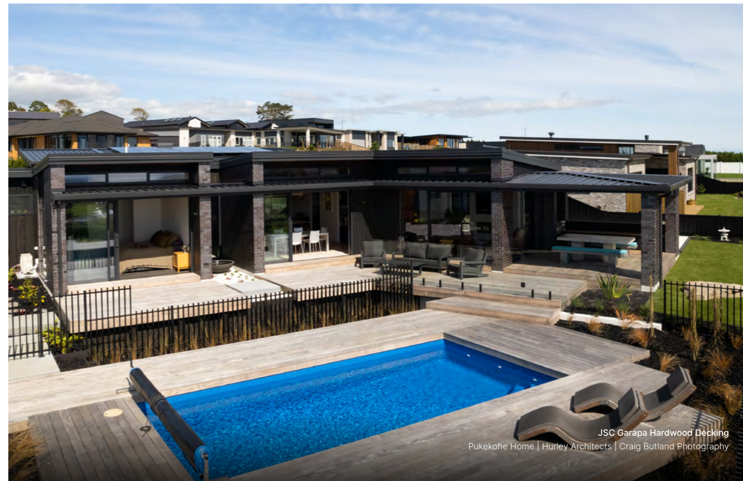
JSC Garapa Hardwood Decking Pukekohe Home | Hurley Architects