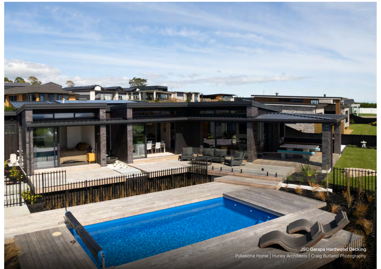
JSC Garapa Hardwood Decking Pukekohe Home | Hurley Architects