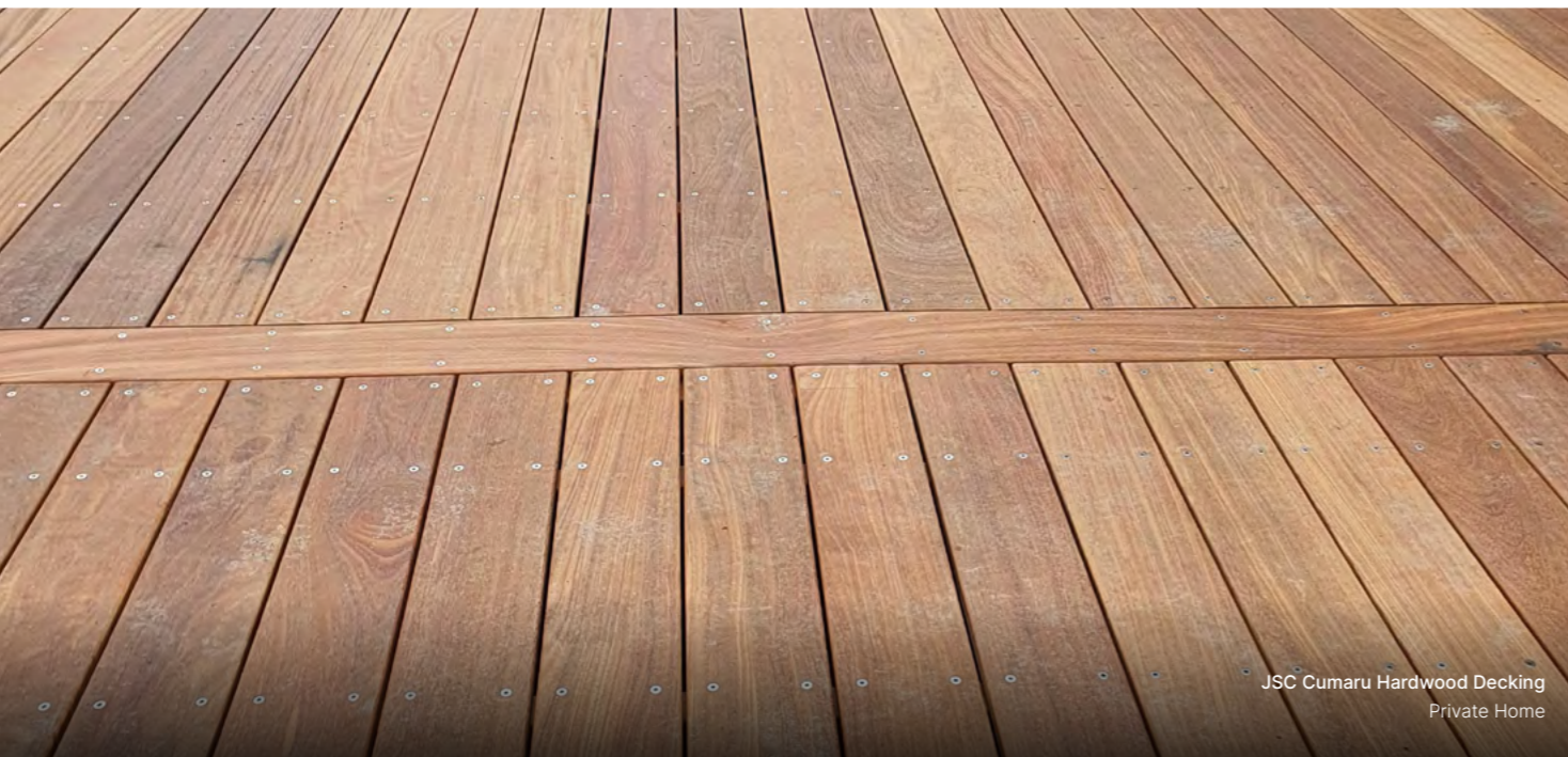
JSC Cumaru Hardwood Decking Private Home