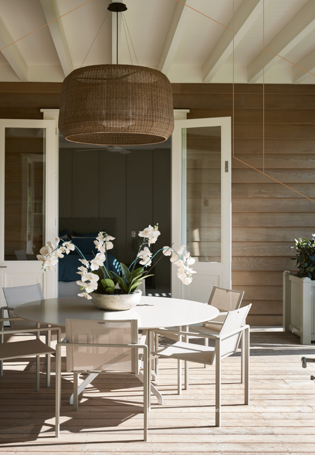
Cox Street Private Residence | Col Architecture