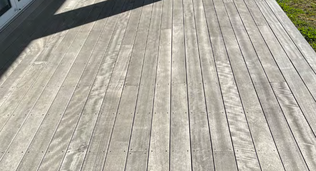
UV Exposed Purpleheart