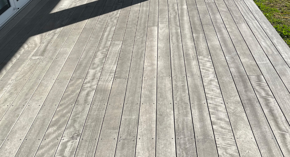
UV Exposed Purpleheart