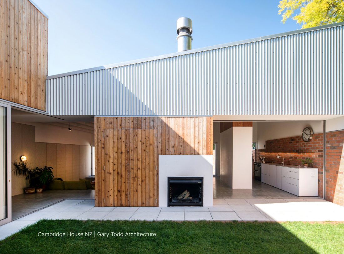
Cambridge House NZ | Gary Todd Architecture