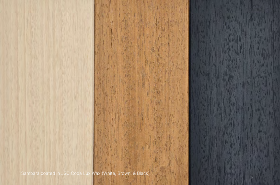
Sambara coated in JSC Coda Lux Wax (White, Brown, & Black)