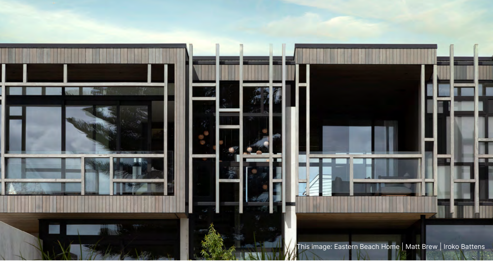
This image: Eastern Beach Home | Matt Brew | Iroko Battens