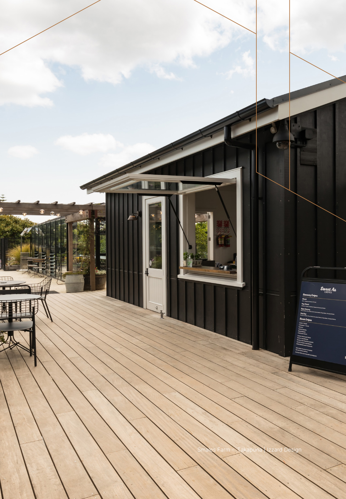
Smales Farm - Takapuna | Izzard Design