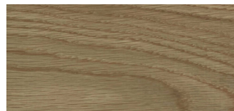
AMERICAN WHITE OAK