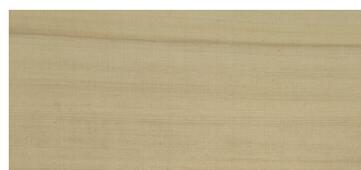
ALASKAN YELLOW CEDAR