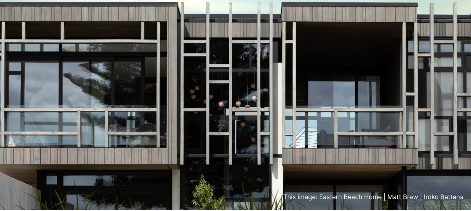
This image: Eastern Beach Home | Matt Brew | Iroko Battens