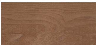
WESTERN RED CEDAR